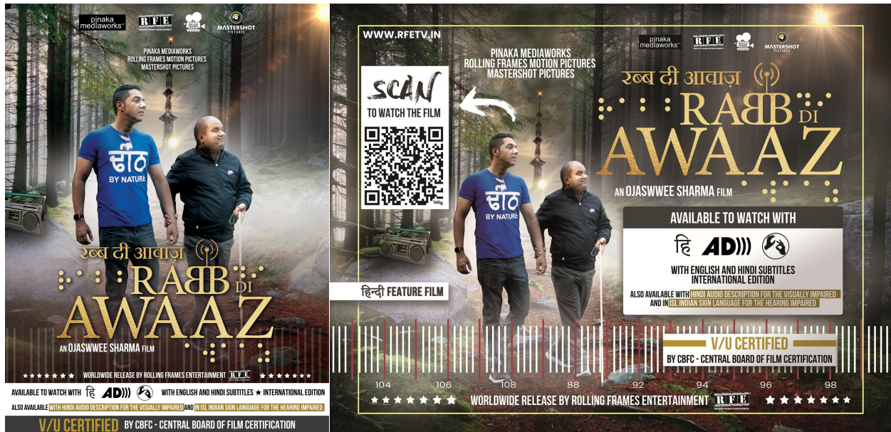
(1) Official Poster of Rabb Di Awaaz and (2) Official Hoarding of Rabb Di Awaaz