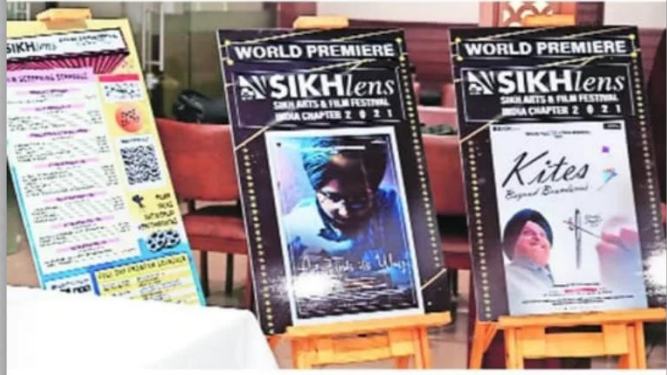
This year, at the festival—which will be held at Tagore Theatre, from 11 am to 8 pm—entry will be free and 24 films from eight countries will be screened.