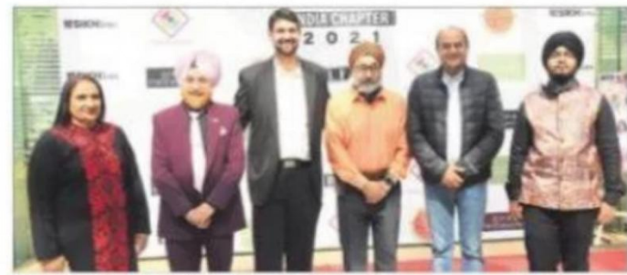
Team SikhLens at the event.